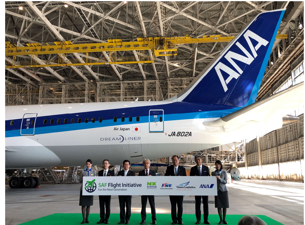
6 Nov, 2020 NH114 Tokyo/Haneda to Houston