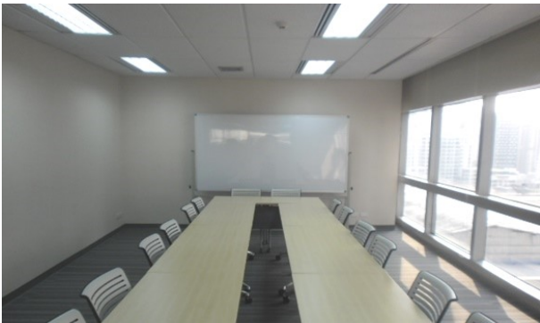
AIRO Meeting Room