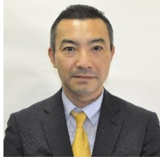
Executive Director / Senior Research Fellow