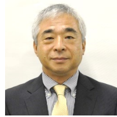
Senior Director / Senior Research Fellow