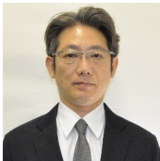
Senior Research Fellow